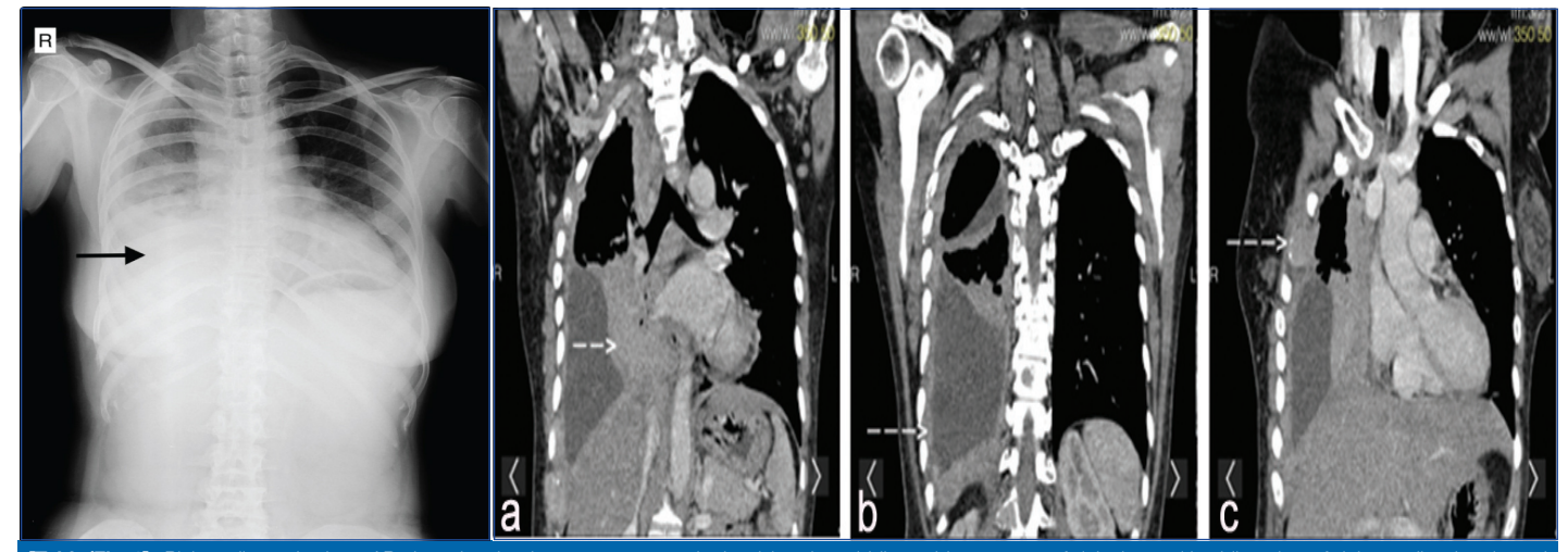
[Table/Fig-1]: Plain radiograph chest AP view showing homogenous opacity involving the middle and lower zone of right lung with obliteration of right cardio phrenic and costophrenic angles (black arrow) with partial decrease right lung volume. [Table/Fig-2]: CECT of thorax in coronal section: a) showing collapse consolidation of right middle and lower lobes (white arrow); b) fibrotic strands in right upper lobe and Moderate right pleural effusion with thickening and enhancement of right pleura (white arrow); c) showing Erosions in right 3rd rib (white arrow). Images from left to right

The word empyema is derived from Greek words "Em" meaning in or into, "Puon" meaning pus. The word necessitans is derived from Latin word "Necessitans" meaning unavoidableness or compulsion. Egyptian physician Emhotep in around 3000 BC gave the first description of EN.While Hippocrates in around 500BC gave the first reliable scientific description [1] and Guillain de Baillon in 1640 reported the first case of Empyema [2]. Sir William Osler, the father of modern medicine, is said to have died in 1919 at age 70 due to empyema [3].