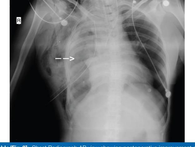
[Table/Fig-3]: Chest Radiograph AP view showing postoperative improvement of right lung volume, increased 4th intercoastal space corresponding to thoracotomy (white arrow).

EN is a rare complication of Tubercular Pleural Effusion (TPE). Incidence of Tuberculosis (TB) in India is around 28 lacs cases with mortality of around 4.2 lacs per year [4]. TPE occurs in about 30% of patients with TB [5]. The mortality rate from EN remains high and it ranges between 6%-24% [6].